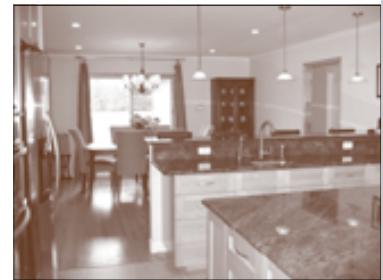
Los Altos Residence

At any given time, the firm also has several small to mid-sized projects. One such project involved clients in Los Altos who enjoy cooking and entertaining. In the home's original interior layout, the front door opened to a long hallway and the kitchen and living areas were completely disconnected from each other. To resolve these programmatic issues, a new more inviting front entrance was designed that opened onto the living room area, a wall separating the kitchen and dining room was removed to allow for casual interaction between the spaces, and the kitchen was re-designed with an open floor plan that provided ample light and storage.