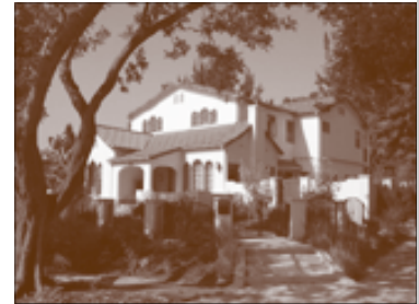
Los Feliz Residence

In a recent project in Los Feliz, California, a second story addition and an extensive remodel was completed for a growing family. The upper floor design included a master suite, two bedrooms with a shared bath, and a guest suite. On the lower floor, an existing bedroom was incorporated into the remodeled kitchen area to create a spacious family room with access to the garden.